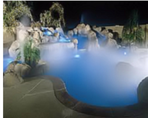
Entertainment industries apply misting systems for special effects, people cooling, and certain environments where a cool and fresh place is desired.