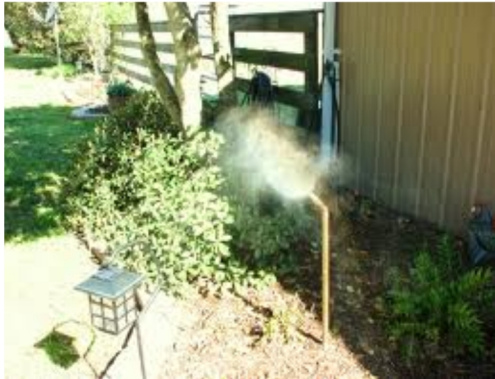
Applications also include residential use where dry areas require freshness. Misting combined with proper ventilation can provide a high cooling effect.