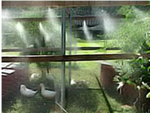
Agricultural applications, where animals require high humidity and/ or cooling effects can be benefited by a misting system. Also useful for farms, zoos, and pet shops.