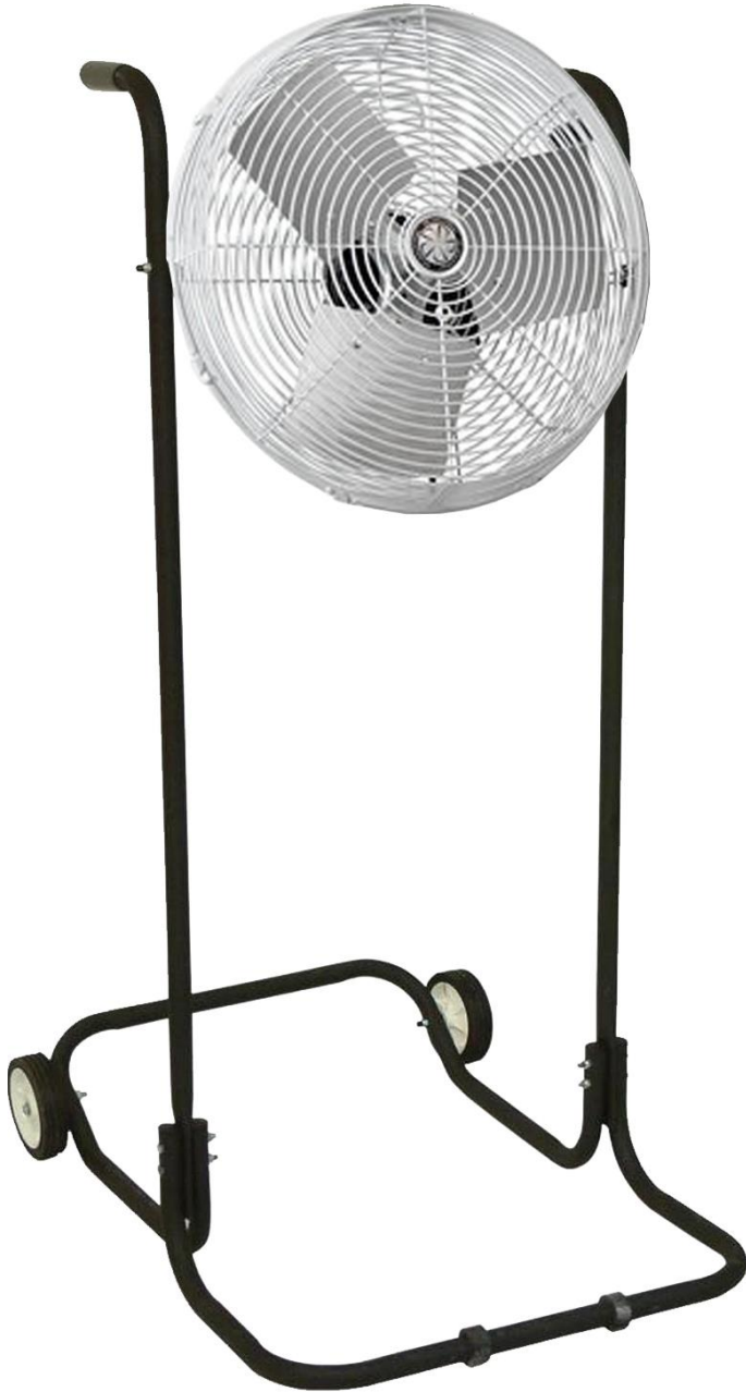
Gallery Image of FH-TESeries Industrial Workstation High Stand