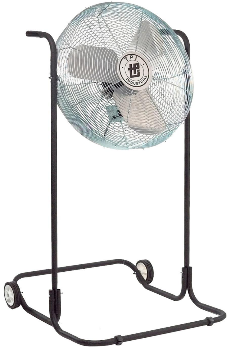
Specific Characteristics of FH-TE Series Industrial Workstation High Stand