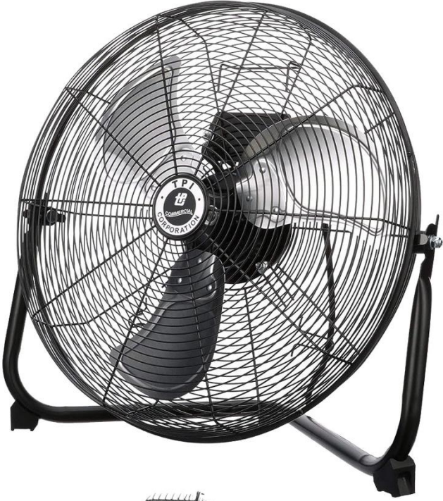
Gallery Image of CF-Series Commercial Floor Fan