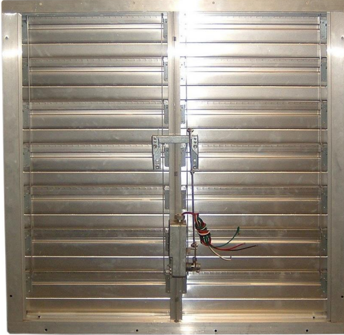
Gallery Image of CESM Motorized Supply Air Intake Shutter