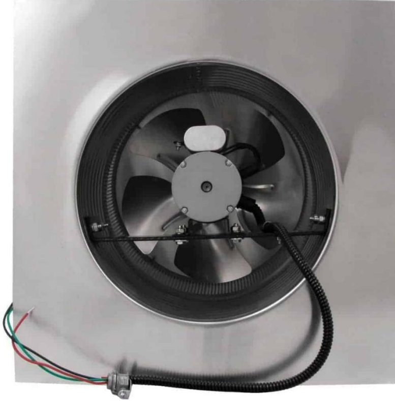
Gallery Image of Attic Fan, AuraFlat.