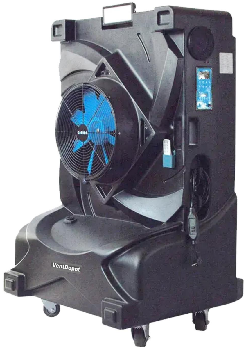
Specific characteristics of Evaporative Cooler, AirMist16.

Manufacturer's Limited Warranty: 1 Years.