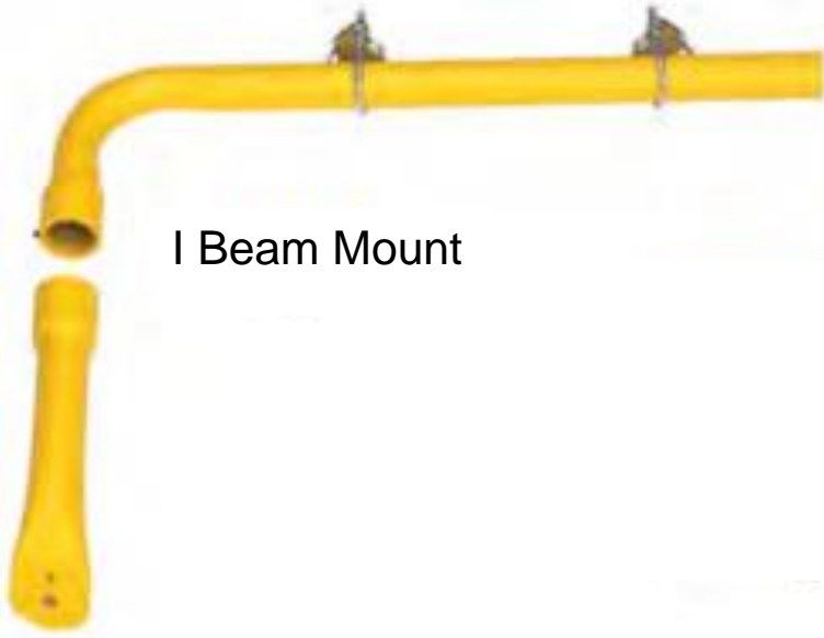
I Beam Mount