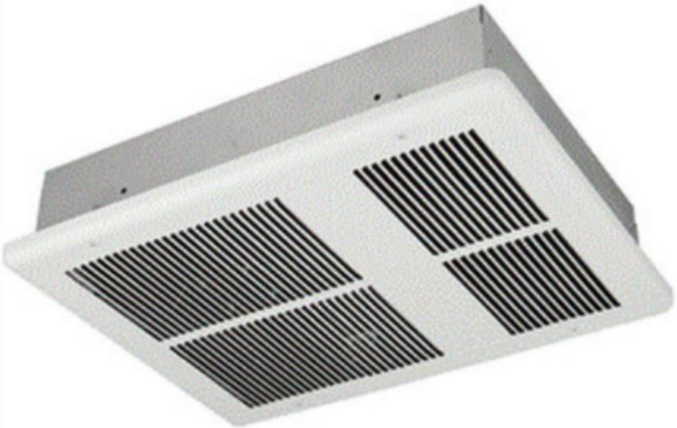
3380 Series Suffix T