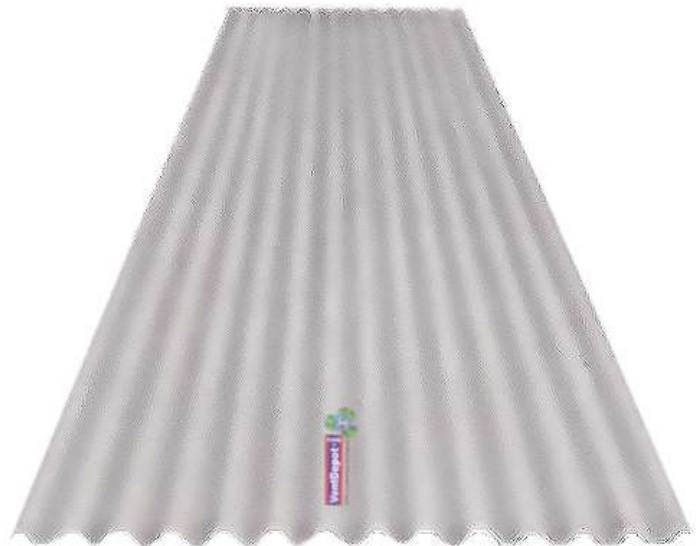
Características Técnicas Específicas de Lámina Acanalada para Techos O-100-Pintro-VD

El O-100-Pintro-VD cuenta con 1 año de garantía sujeto a clausulas VentDepot.